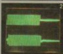
2. Tone burst response of L810 midrange driver at 2 kHz.