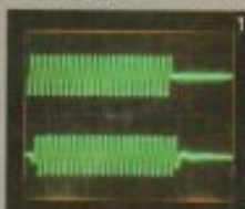
1. Tone burst response of L810 high-frequency driver at 10 kHz.