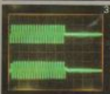
3. Tone burst response of L810 bass driver at 200 Hz.

All tone bursts are actual oscilloscope photographs. In each frame, the top trace represents the input to the L810, and the bottom trace is the measured output. All measurements are of the entire speaker system with drivers mounted in cabinet and receiving test signal through crossover network. Excellent tone burst response over entire range ensures faithful reproduction of musical detail.