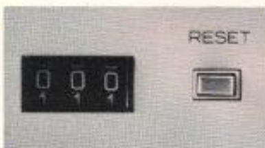
The tape counter can be used to index the selections on the tape. Push the button to re-set to "000".

The tape counter provides a convenient way to index your tapes. Set it to zero at the start of a tape by pushing its RESET button, then make a note of the counter reading at the beginning of each selection on the tape. (Counter reading will usually not correspond to those on other cassette decks.)