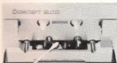
Use a cotton swab (such as a Q-Tip) moistened with head cleaning fluid to clean the tape heads.

Cleaning the tape path. As the tape plays, tiny bits of the magnetic coating are scraped off by the heads and tape guides. These magnetic particles build up over a period of time and can prevent the tape from maintaining full contact with the tape heads, thereby impairing the high-frequency response. Particle buildup can also lead to speed variations. The best solution to these potential problems is routine cleaning of the tape heads and guides after every 20 hours of tape deck use. Use a Q-tip or other cotton swab moistened with head-cleaning solution (available from your Concept dealer). Gently clean the heads, capstan, tape guides, and pinch roller.