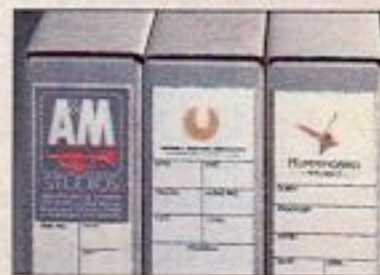
Our monitor speakers can give you the level of accuracy and realism pros have come to expect.

So check our references. Both the speakers and the experts. You'll like what you hear.