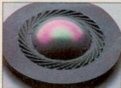
Known for its exceptional accuracy and consistent response over a wide range of frequency, beryllium is the material of choice for our NS-500M tweeter dome.

We make this point because of the response our studio monitor speakers have received from recording engineers at top studios like A&M, A&R, Hummingbird, Universal and Westlake. As well as Yamaha's own music research and development facility and professional studio in Glendale, California.